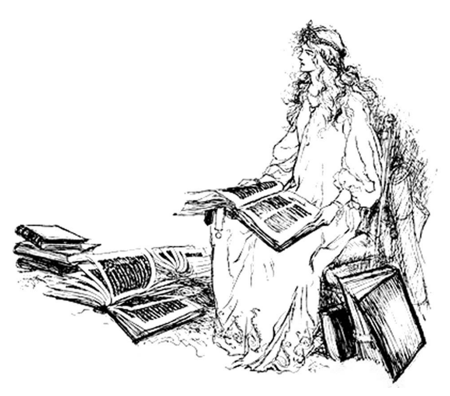
"Misdom knows all knowledge is incomplete"