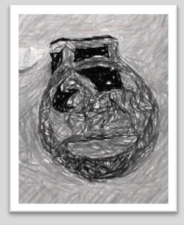
This horse brass used to adorn a fireplace in High Chalcis - it has been smuggled out of Reikos by previously captured Highborn refugees who made a daring escape into Peakedge Stead.