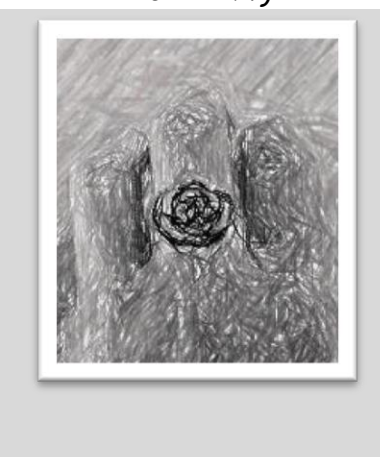
This ring was once used as the ring of the Knight of Flowers in Drycastle, stolen by a Druj raid and recently recaptured by a daring raid by knights-errant taking advantage of the turmoil between orcs in the Barrens.